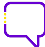
Voice Prompt & Forms