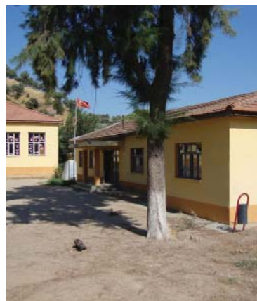
These images have been provided by individuals working with the project operators